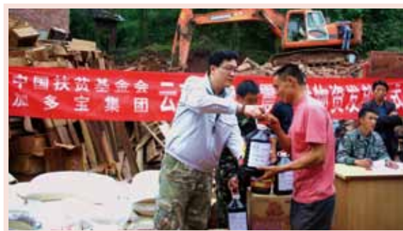
The JDB Group donates a large amount of grain and oil to victims in Shiya Village, Yiliang County, Yunnan.