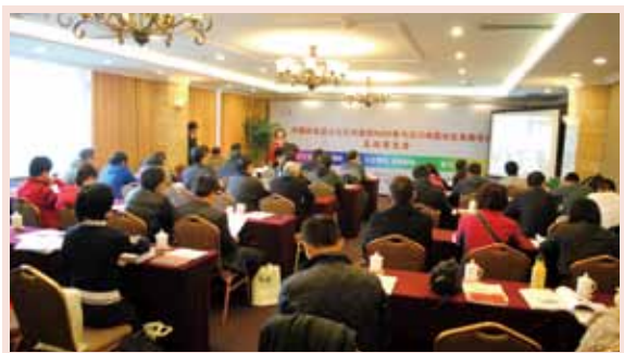
On Nov. 21, 2012, the summing-up meeting for CFPA's supporting grass-roots NGOs to participate in Wenchuan earthquake community development project was held in Chengdu.