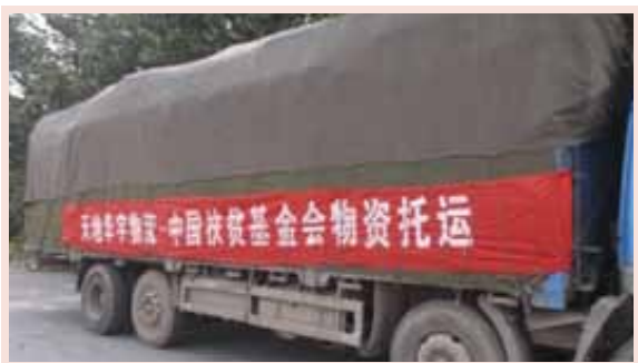
TNT Hoau Group, a strategic partner for disaster relief of ours transports our relief reserve materials to disaster-stricken Yiliang County, Yunnan rapidly, safely and free of charge.