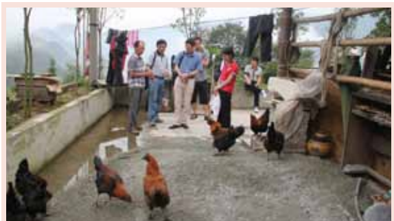
In Huangjiayuan Village, Yingxiu Town and Xicao Village, Sanjiang Township, Wenchuan, 20 disaster-stricken households funded by the project expanded chicken breeding scale so as to recover from the disaster and rebuild livelihood ASAP. The picture shows in Jul. 2012, the surveyors went to the project area to carry out site inspection.