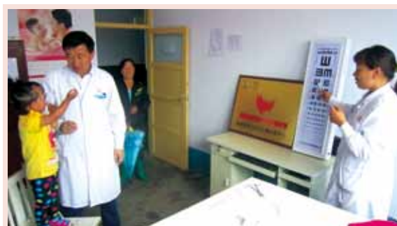
Under the support of Tiens Group, the Mom & Infant Safeness Program initiated the “Big Hands Holding Small Hands” Sight Correction Program in Weichang County, Hebei, providing the poor children with amblyopic and strabismus screening and treatment services.