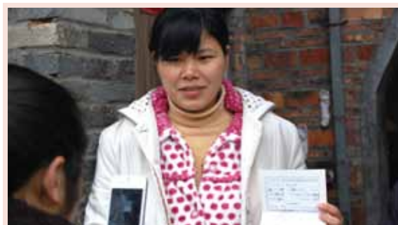
Since 2008, Xiamen Zhongsheng Grain & Oil Group Co., Ltd. began to provide funds for poor lying-in women in Zhenghe, Pingnan and Changting counties in Fujian in the long term.