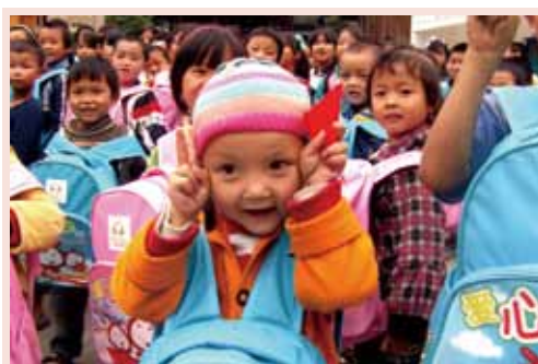
On Oct. 9, 2012, the "Dream-come-true Action" package issuing at Gaoze Primary School in Liping County, Guizhou.