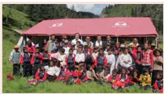
On Nov. 6, 2012, the Yushu Ganda Village transportation team profit-sharing conference was held.