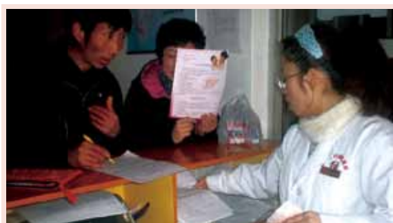
Under the support of Audi North Area Charitable Fund, 610 poor pregnant and lying-in women in Huguan County, Shanxi were funded by the Program in 2012.