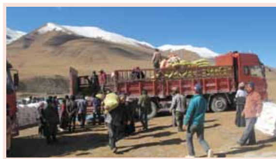
On Nov. 6, 2012, the Yushu Ganda Village transportation team profit-sharing conference was held.