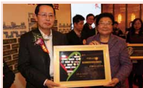
At the New Great Wall Project 10th Anniversary Commemoration & Commendation Meeting, China Minsheng Bank, the private enterprise that made the most donation won the “New Great Wall Project” Award for Outstanding Contribution to Educational Poverty Alleviation, and Gu Xiulian, Vice-chairman of the Standing Committee of the 10th National People's Congress attended the meeting and awarded the medal.