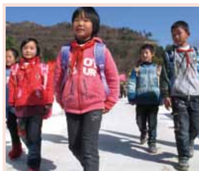
Suning Group donated RMB 10,000,000 for building 170 "bridges of love" in poor villages in China. The picture shows the Fangwan "Suning Bridge" in Jinshan Village, Jinzhai County, Anhui is completed.