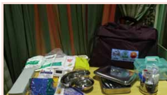
The midwife kits donated.