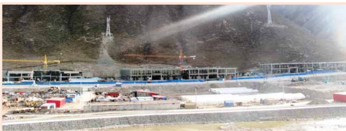
The agricultural and animal products comprehensive market under construction in Yushu.

In Yushu, the agricultural and animal products comprehensive market project funded by JDB Group is under construction as scheduled, and it is expected to be completed and put into use in 2013. The Ganda Village transportation team project and the Deda Village milk cow comprehensive development project have already yielded considerable economic income.