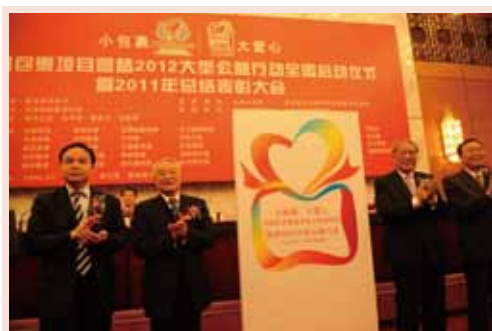
On Apr. 11, 2012, "the National Launching Ceremony of the School Package Program 2012 and the Summary & Commendation Meeting 2011" was held in the Press Conference Hall of the Great Hall of the People, and Cheng Siwei, Vice-chairman of the Standing Committee of the 9th and 10th National People's Congress attended the meeting.