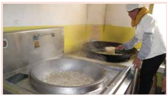
“Donate 1 Yuan · Show Love · Send Nutrition” provided Yunnan Xuanwei Zengping Primary School with “Love Kitchens” project equipment, greatly improving the kitchen cooking conditions.