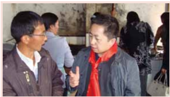
On Apr. 1, 2012, Secretary General Liu Wenkui paid a visit to Zhongyuan Primary School, Lushui County, Yunnan, learning about the daily life of poverty-stricken students.

Besides, by the end of 2012, the “Sunshine Playground” Program raised over RMB 30,000,000 and built more than 730 school playgrounds, enabling over 500,000 students to take exercises thereon; the “Love Library” Program raised over RMB 4,000,000, and built libraries for 116 schools in 28 counties (prefectures) in 8 provinces (municipalities), enabling nearly 40,000 teachers and students to enrich their knowledge and broaden their horizons.