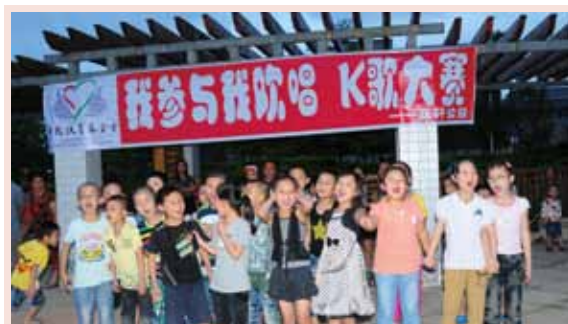
In Jul. and Aug., 2012, Youth Relay Bus Stop Project held an "I Join & I Sing -- Karaoke Contest" in Yongkang Garden, Yongchang Community.