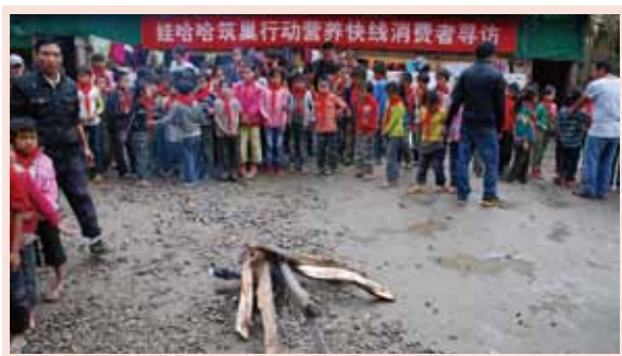
Wahaha “1 bottle 1 penny” Nest Building Action organized the Nutrition Express consumers visit, carrying out earthquake and fire drills for the children.