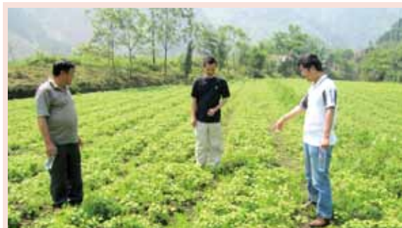
In Jun. 2012, the project specialists went to Datianchi Village, Mianzhu to pay a field visit ginkgo seedlings planting demonstration project.