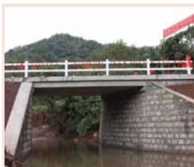
Zhongpo "Bridge of Love" in Minjiang Village, Zhenyuan County, Yunnan built by Merchants Securities.