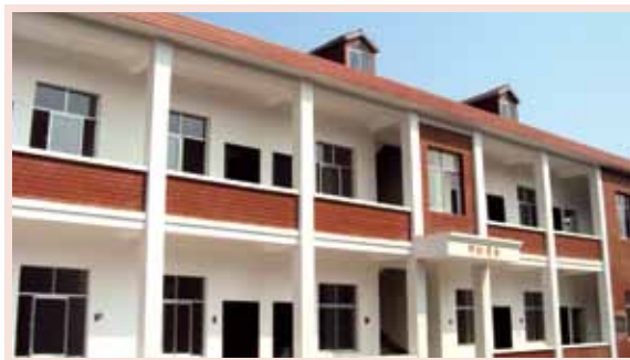
The Heren Dormitory of Huangtang Primary School, Chaling County, Hunan built by Heren Charitable Foundation.