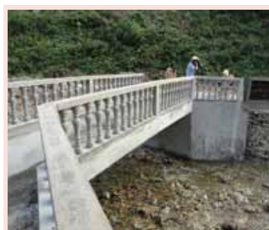
Chousi "Bridge of Love" in Zhoujia Village, Chakou Town, Shexian County, Anhui donated by Jiangling Motors.