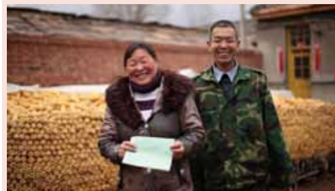
Project Loan Households.