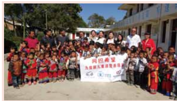
“Hope Online -- Send Nutrition To Starving Children” Tencent monthly donation & visit activity: the caring net friends visiting the beneficiary school Shilin Zhalong Primary School.