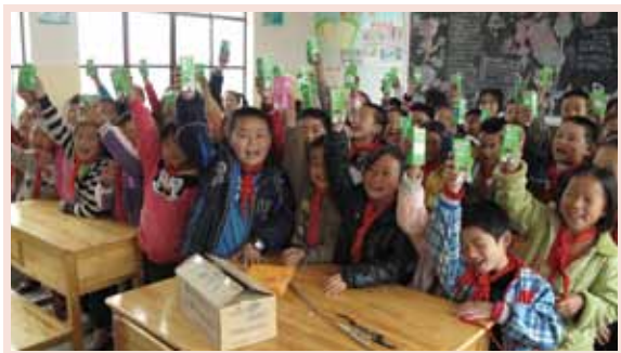
Children at Yunnan Xuanwei Dazuo Primary School enjoying the meals happily.

The assessment results of Chinese Center for Disease Control and Prevention (CDC) show that 9 months after having the nutritious meals provided by the Program, the rate of severe marasmus in the student decreased from 16.3% to 11.5%, and the rate of anemia decreased from 6.1% to 3.9%. By contrast, the rate of anemia of the control group increased from 12.9% to 13.6%.