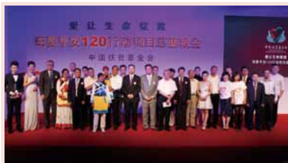
“Love Makes Life Bloom – The Charity Party of Maternal and Infant Health Project” was held on May 27, 2012.

In addition, the Orphan Sponsorship Program during 2008 and 2012 raised funds RMB 5,434,000, subsidizing over 5,000 orphans in poverty-stricken areas, helping them build self-confidence and foster a positive outlook on life.