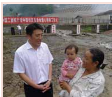
In Jul. 2012, the old in Gaofegnguan Village, Wanyuan City, Sichuan express thanks to ICBC for building the "bridges of love".