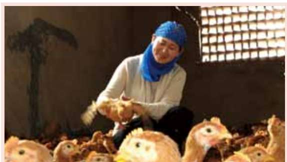
The joy of the poor ethnic-minority women poultry farming project's beneficiary after successfully raising the chickens Dazhai Hui Township, Pingliang City, Gansu. May, 2012.

In Wenchuan earthquake stricken area, we entrusted NGOs through open tendering to carry out post-disaster reconstruction and help the victims provide for themselves by engaging in production, erase psychic trauma, blend in the new community, and embrace the new life. Now the project has exhibited remarkable effect of alleviating pain and rebuilding livelihood.