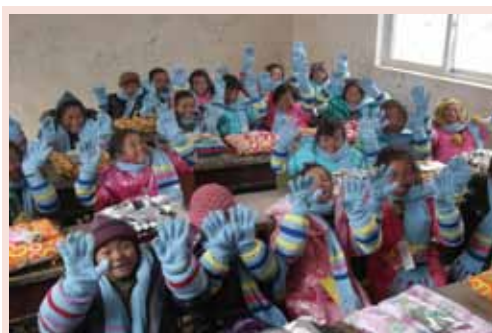
On Dec. 28, 2012, the "Warm Action" package issuing in Haiyuan County, Ningxia.