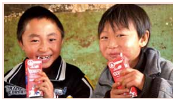
Children in Zhaotong project area, Yunnan enjoy a nutritional meal (milk and egg) every day.