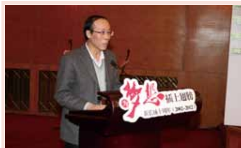
Zheng Wenkai, Deputy Director of the State Council's Poverty Alleviation Office attended the New Great Wall Project 10th Anniversary Commemoration & Commendation Meeting.