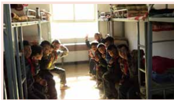
Children in Hongqiao Center School in Ninglang County, Yunnan moved in Suning Dormitory.