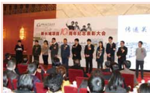
On Dec. 23, 2012, the New Great Wall Project 10th Anniversary Commemoration & Commendation Meeting was held in the Press Conference Hall of the Great Hall of the People.

Moreover, funded by Hengda Group, over 200 teenagers from needy families together with other teenagers who shared a football dream were able to receive high-level football training while taking normal courses at school in Qingyuan, Guangdong.